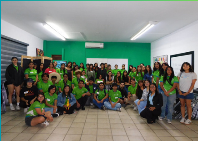
Our September Seminar on How to develop healthy habits, we celebrated Mexican Independence Day wearing Mexican clothing or accessories. Viva Mexico!