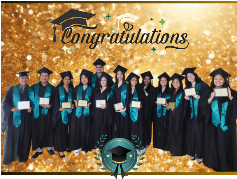
A Strong Start to the 2025–2026 Academic Year 🌟

This past quarter has been filled with milestones and inspiring moments at Green Scholarship Program. Together, we continue to empower students in their educational and personal journeys: